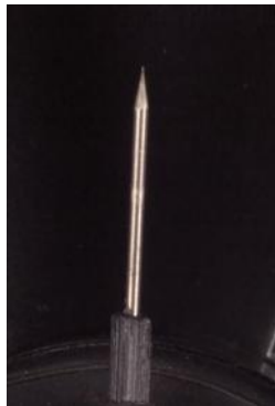
Emitters are made of a special tungsten alloy and are replaceable. AC operation of the ionizer assures a long service life.