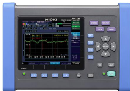
POWER QUALITY ANALYZER PW3198