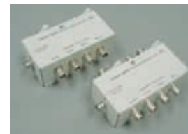
9268 DC BIAS VOLTAGE UNIT Maximum applied voltage: \pm 40 V DC 9269 DC BIAS CURRENT UNIT Maximum applied current: \pm 2 A DC