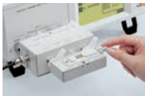
Example of connecting the 9262 and 9268 / 9269

The 9268 can be used for voltages up to a maximum of DC \pm 40 V. The 9269 can be used for currents up to a maximum of DC \pm 2 A.