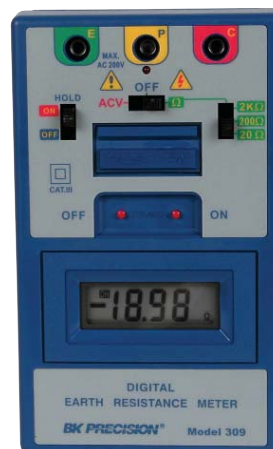
Earth Voltage Measurement