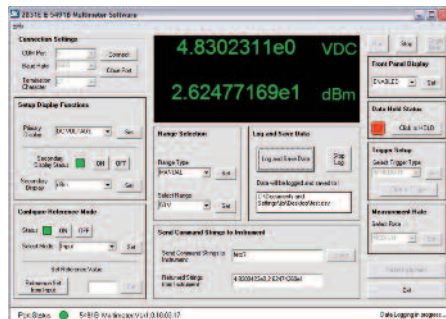
Application software screenshot

The 2831E and 5491B are programmable via USB and RS232 (5491B only) interface using industry standard SCPI commands. Users can control and configure the instrument from a remote PC and retrieve measurement results for further analysis. The meters can also be remotely controlled using application software (downloadable from the B&K website), which supports front panel emulation and data logging of measurement results.