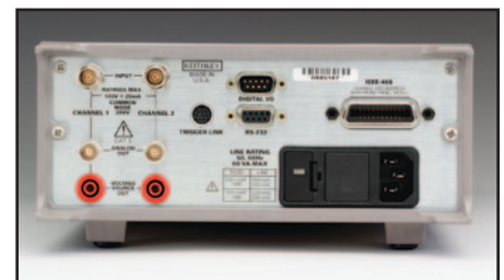
Model 2502 rear panel

The Model 2502 offers current measurement ranges from 2\text{nA} to 20\text{mA} in decade steps. This provides for all photodetector current measurement ranges for testing laser diodes and LEDs in applications such as LIV testing, LED total radiance measurements, measurements of cross-talk and insertion loss on optical switches, and many others. The Model 2502 meets industry testing requirements for the transmitter as well as pump laser modules.